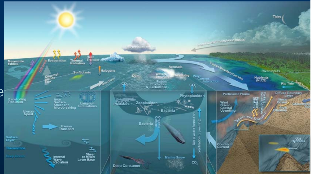
OOI, Regional Scale Nodes (Delaney, 2008)

on a global change context (where climate change is one of the most important, but not the only one...), and following sustainability principles